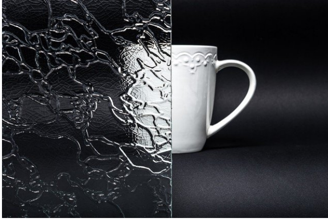
ORNAMENT DELTA 4