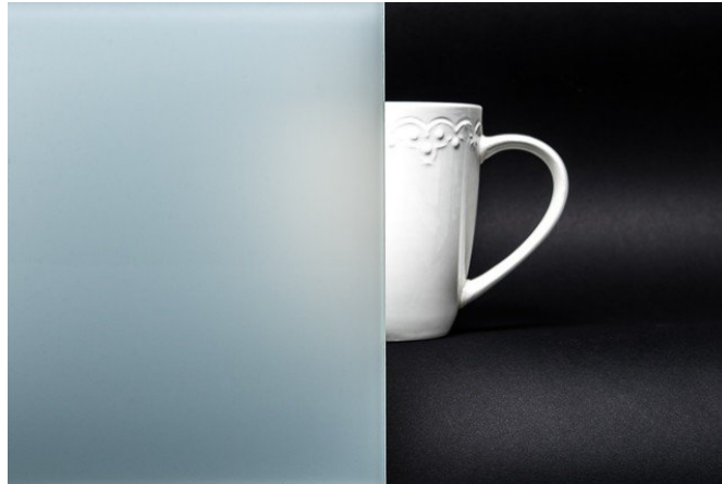
33.2 ("SAFETY") MATT FILM