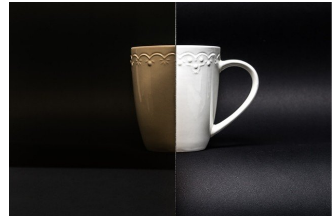
REFLEKTOFLOAT BROWN 6