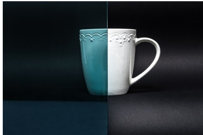
REFLEKTOFLOAT BLUE 6