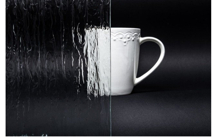
ORNAMENT SILVIT 4