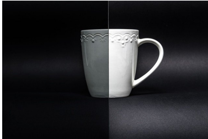
ANTISOL BROWN 6