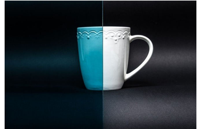
ANTISOL BLUE 6