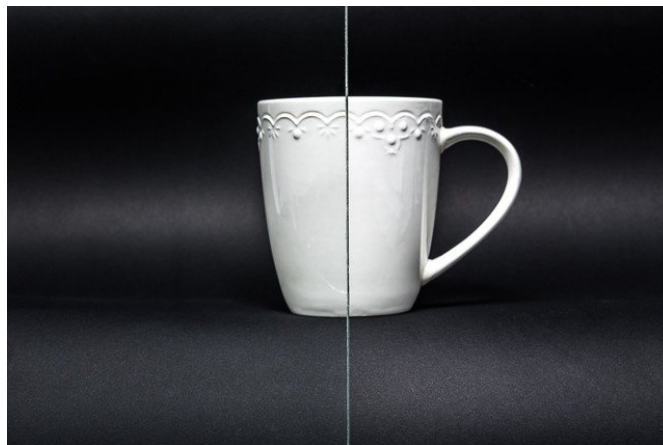
ANTISOL GREY 6