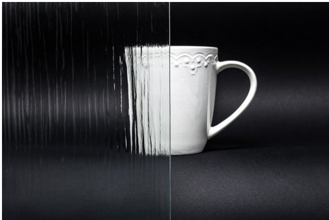
ORNAMENT - STRIPES 4