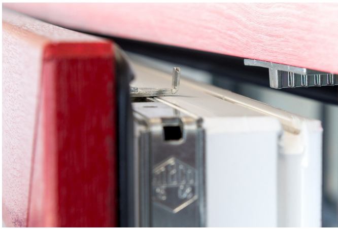
MECHANISM OF MULTISTEP TILT